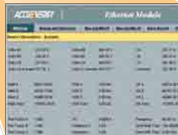
Real Time Metering