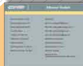
Web & Email Setting